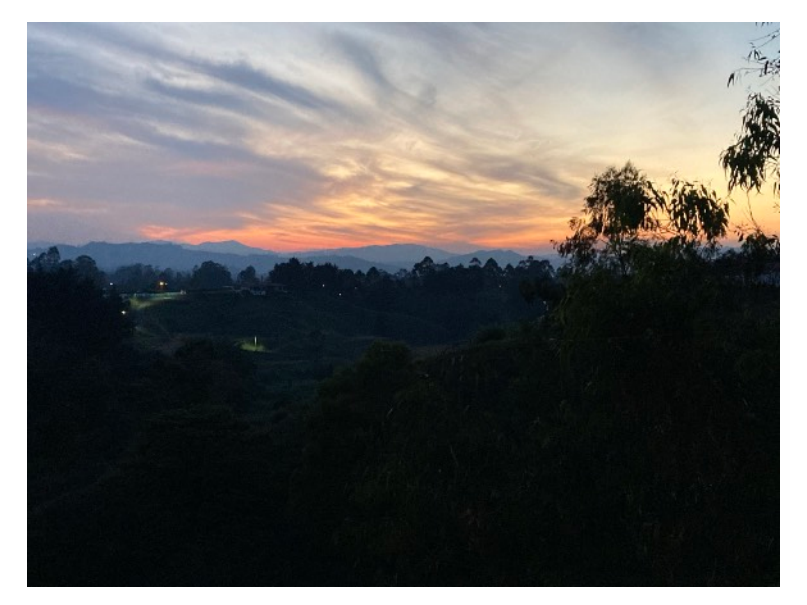
Don't worry, I won't deprive you of another good Colombian sunset.