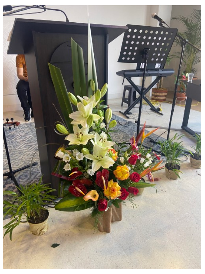
A beautiful floral arrangement made by a florist in the church especially for Easter Sunday. Each flower has a special significance in the Resurrection story, and it was amazing to hear the thought behind the design as she put it together.