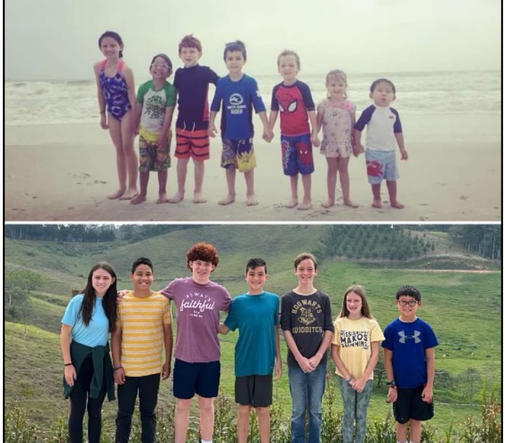
One last pic from the Maddens' visit. The top picture is from 2016 when we lined them all up by age on a family beach trip. We decided to recreate it (without the beach) to see the difference 8 years later. How they've grown! Now that we have three new little cousins on the Boersma side (well, two plus one on the way), we need to recreate it with the whole cousin crew!

I am forever grateful for the bond my boys have with my two sisters' kids, even a continent away.