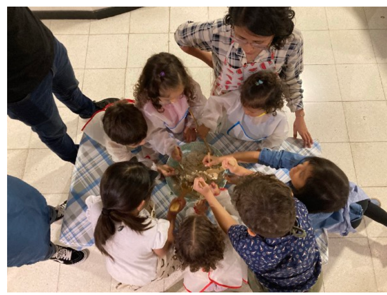
Children's Sunday school. It's always hands-on and all-hands-on-deck!