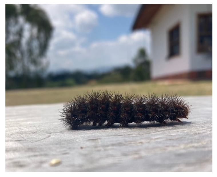
Colombian critters who turn into pets for a day.