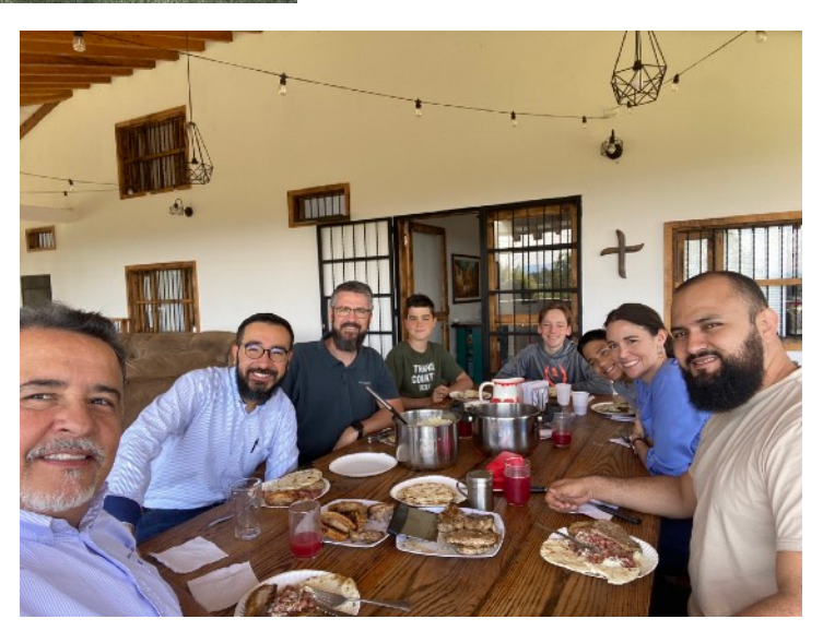
Lunch with several local pastors