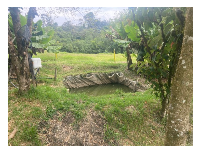
The little pool at the bottom of the valley near our house where we have been pulling water from for the past 3 months. It has dried up now, and we are praying for rain!