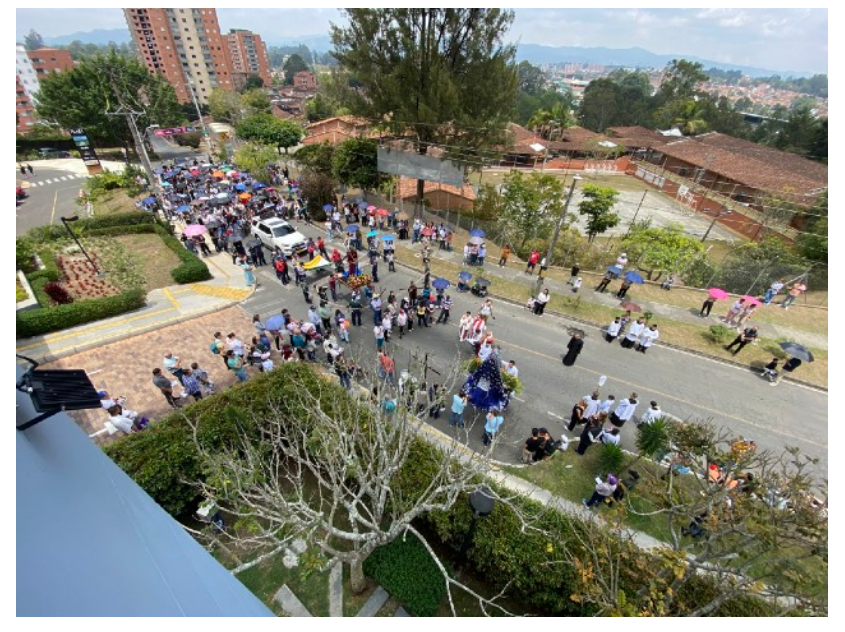
Holy Week is filled with all sorts of religious and cultural events. This processional passed by in front of our teammate's apartment while we were having a team meeting, and we were able to watch it. These come with a mix of religious influences and superstitions, and it reminds us of the deep need for the gospel in dark places.