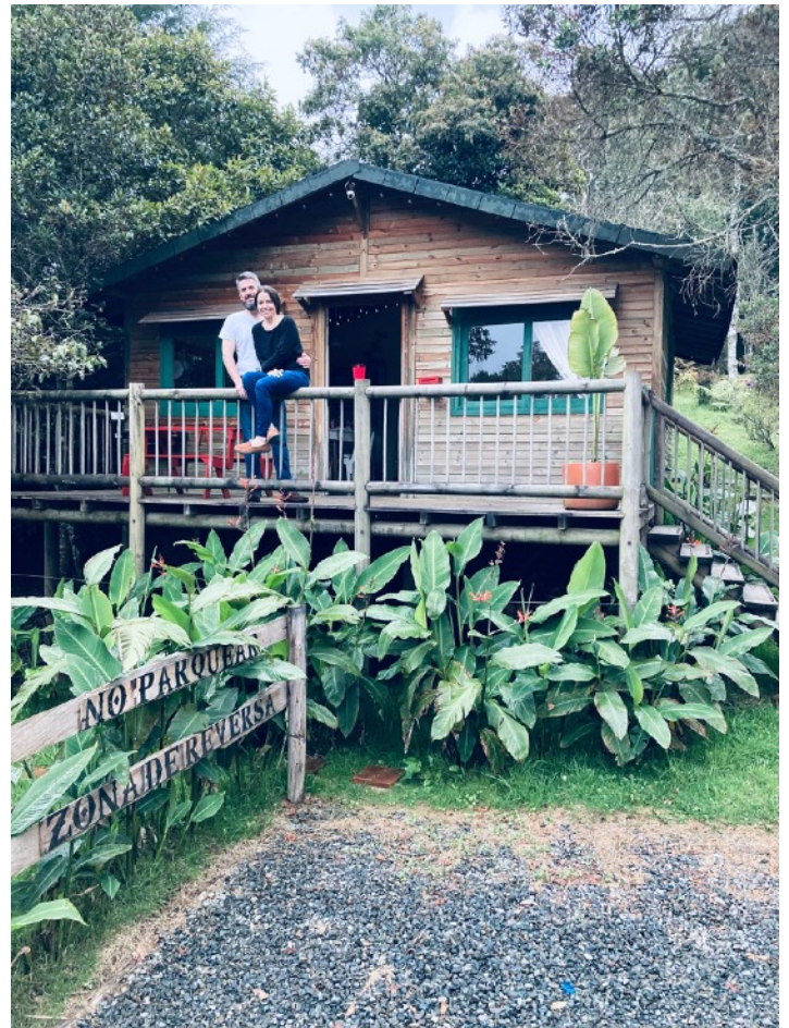
A couple of months ago our teammates kept the kids so that we could sneak away for a night. We went to a "tiny house" style cabin about an hour away up on the mountain. It was wonderful!