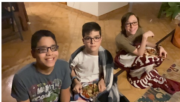
An eye doctor visit ended with all 5 of us in glasses.