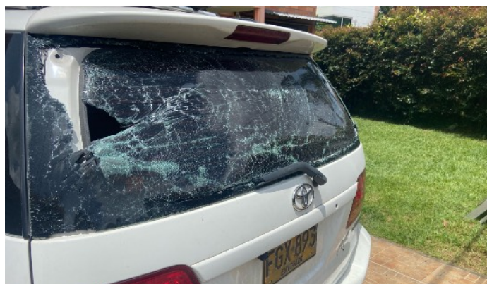
Our front gate came off the track and fell over...right onto the car. This was a fun ordeal to get fixed, and the story includes policemen and almost having the car impounded. But thankfully it turned out well in the end.