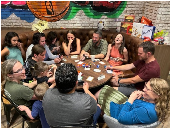
Some of the Colombia missionaries enjoying game night at our mini-retreat. This is such a fun crew!