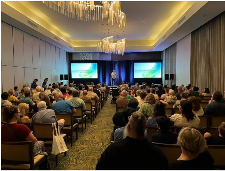
The large-group sessions at the MTW Americas Area Retreat. There were around 250 of us in total, I think, including kids and staff. We are thankful to be counted among this group!