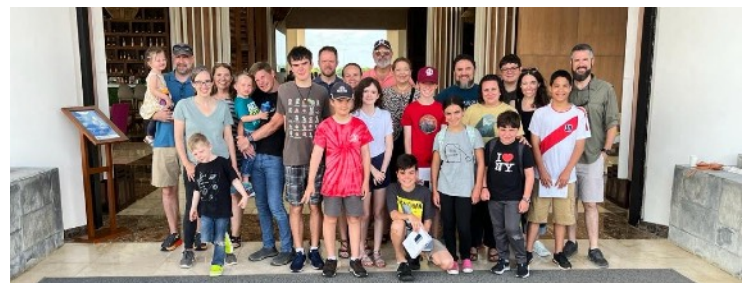
Saying goodbye at the end of the mini-retreat.