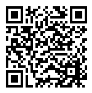
You can donate towards the ministry in South America directly from your phone... simply scan this QR code with your phone's camera.

Despite these challenges, we have seen amazing works of gospel ministry, both word and deed, extending out from local churches. Financial aid, food distribution, medical support, and gospel preaching have been at the forefront. But can I ask you to pray for our missionaries? They are tired and weary from having to both serve their own families under these difficult circumstances as well as serve those around them who are suffering.