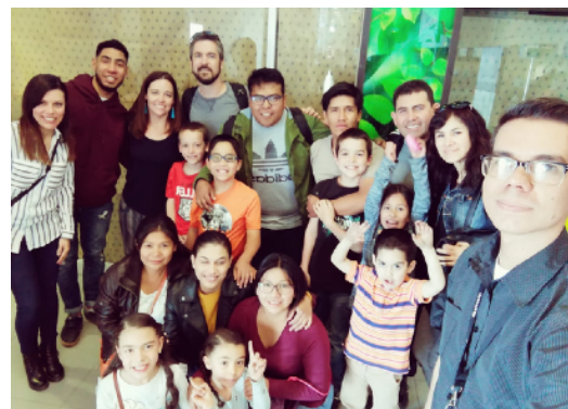
Saying farewell to dear friends

It was a harder goodbye than we had anticipated. Over the last almost-6 years of our lives in Arequipa, Peru, we have experienced many ups and downs as a family in ministry together. But the Lord has been gracious to allow us to close our time in Arequipa on such a high note. We have forged friendships that will not be forgotten. The Lord has given us brothers and sisters in ministry that will literally last for eternity. We could not have asked for a