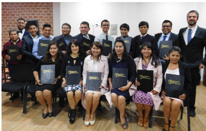
SBR Class of 2019

Not only did we graduate 17 students, but we also formally turned over the Arequipa extension of SBR to local leadership. They were charged with the responsibility of teaching and preaching the gospel of Jesus Christ and equipping others for the ministry. It was a delight to see people's astonished looks to know that SBR would continue in Arequipa with presencial courses as well as virtually transmitted ones. Please pray for these men as they continue the ministry of SBR in Arequipa, and for us as we continue to develop courses and materials for this campus and mentor the leaders.