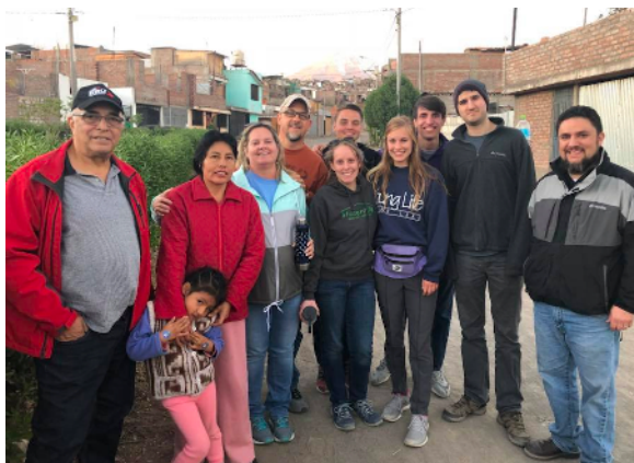
Prayer walking the streets of AQP with Christ Church, PCA.