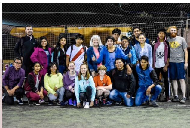
Taking a break from ESL classes offered by Trinity PCA to play a little fútbol.