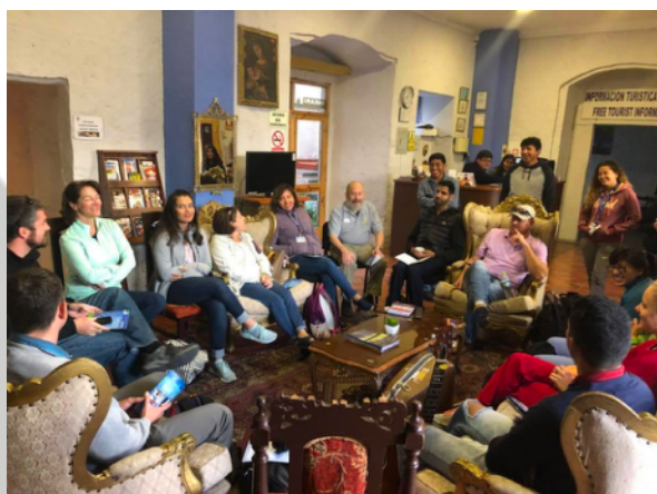
Team from FPC Chattanooga getting ready to help with a medical campaign.

Finally, we finished July with a team from Trinity PCA in Murfreesboro, Tennessee who hosted and led an English Camp for the community. Being able to speak English is a huge advantage when looking for a job, so the English camp was a huge blessing to the 50 students that participated in the camp. Even more important than learning English, many friendships were forged and stories were shared. We closed off the week with a traditional American Grill Out which was a first for many of the students.