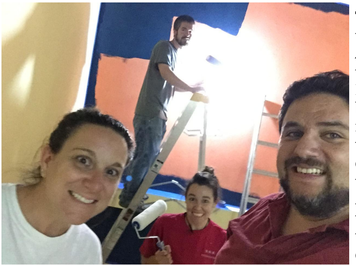
Putting in a little elbow grease at the Seminary offices.

The third testimony we want to share is that Christ continues to work here in Areguipa, Peru. Even in the midst of many tears and moments of anxiousness, the Lord continues to carry us through as he builds his church in Peru. As these events in our personal lives have unfolded, our team has also been in the planning stages of planting a seminary. It is by God's grace that we are set to launch Seminario Bíblico Reformado in March where we hope to train and equip church leaders through theological education and hands-on experience. As we launch the seminary, we also see it as a tool to equip the local church, Iglesia La Roca, that we have been