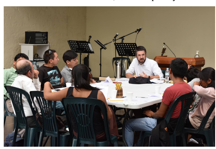
New Members Class