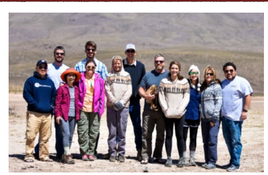
Vision Trip Team

From Texas to Tennessee, Georgia to Pennsylvania, a team from all over the US came to Arequipa on a Vision Trip. What do we mean by Vision Trip? A Vision Trip can have different motives for each participant. There were some people who came to consider long-term ministry in Arequipa. Others wanted a glimpse of