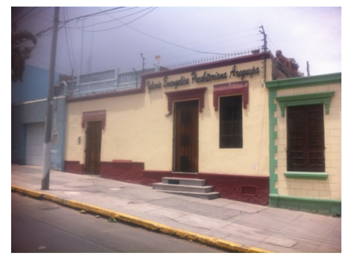
Where we meet for worship.

Please pray for our relationship with this body of believers as we work through the joys and challenges of partnering cross-culturally with a group of believers who have nine years of history. When we first arrived in Arequipa, we knew we could not set out to plant new churches without first attempting to help any existing Reformed communities (if there were any). The seeds of this community of believers are ready for watering and ready for growth, and we are thankful for their invitation to work alongside them.