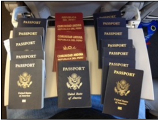
Our 17 passports!

Well we made it! After much anticipation, excitement, and no small amount of work, we are on Peruvian soil. Actually, the “no small amount of work” part would be why we are writing you this newsletter a month after arriving in Peru. It has been a bit of a whirlwind, but we feel overwhelmingly blessed to be on the ground in Arequipa, Peru, where the Lord has called us to serve long-term. Thank you for your prayers and support as we have needed every ounce of it during this difficult transition. The Lord has truly been gracious to us.