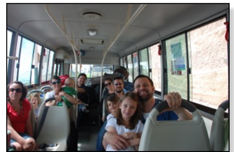
Transportation in Lima

Closing out our time in Bogota and boarding a plane to Lima, Peru was no small feat. The Lord was gracious in helping us sell our three cars and things that we could not bring with us. Closing out our houses and business in Colombia went as smoothly as we could have hoped. And for nostalgia sake, we ended our time in Colombia where we began....in the Baptist Missionary House.